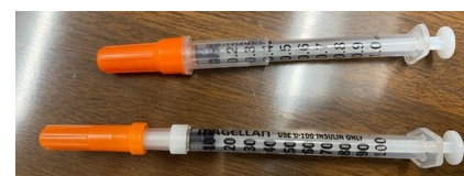
Figure 1. Cardinal Health tuberculin syringe (top) looks similar to the U-100 insulin syringe (bottom).

A pharmacy recently purchased Monoject 1 mL tuberculin (TB) syringes from Cardinal Health that have an orange cap over the 1/8 inch 25-gauge needle. The TB syringes used previously had a red cap. Cap colors are based on the International Organization for Standardization (ISO) standards 7864 and 6009 that recommend an orange hub or needle cap (if they are pigmented) for a 25-gauge needle. (An unpigmented hub or needle cap is also acceptable.) The pharmacy placed the orange-capped TB syringes into circulation, and staff immediately identified the potential for confusion with insulin syringes with a 25-gauge needle attached, which also have an orange cap ( Figure 1 ). Using the wrong syringe type is bound to cause confusion and lead to potential dosing errors. The orange-capped TB syringes were removed from general circulation and will only be available when administering a PPD (purified protein derivative) test.