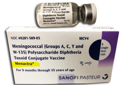
Figure 1. The Menactra carton and vial are prominently labeled as meningococcal polysaccharide diphtheria toxoid conjugate vaccine and are indicated for patients 9 months through 55 years old.

When we reached out to Sanofi Pasteur to suggest differentiating these packages, they told us that Menactra will be phased out when the supply is fully depleted, which they anticipate will be mid-2022. For now, if your organization purchases both products, store these products separately and use barcode scanning to prevent dispensing and administration of the incorrect product.