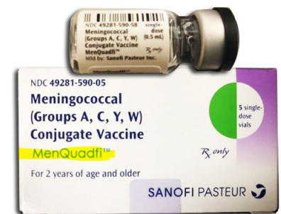
Figure 2. The MenQuadfi carton and vial are prominently labeled as meningococcal (groups A, C, Y, W) conjugate vaccine and are indicated for patients 2 years and older.