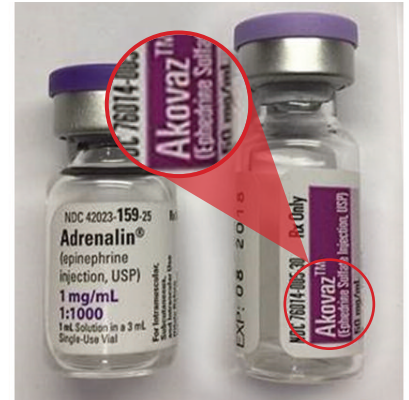
Figure 1. Although somewhat different in overall appearance, the purple cap and label may have contributed to several mix-ups.

mistaken as EPINEPH rine, manufactured by PAR Pharmaceutical. Both products are available in small vials with purple caps, as noted by the person who sent us the report. Purple is also on the vial labels, and the generic names of the drugs can look similar, especially with the narrow print used by Éclat on its ePHED rine label ( Figure 1 ). Also, these drugs are often stored near each other in areas such as labor and delivery and the operating room.