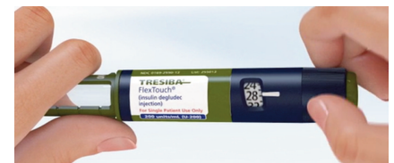
Figure 1. Tresiba U-200 pen allows dosing increments of 2 units, so only even numbered doses can be delivered.

With the introduction of the TRESIBA (insulin degludec) U-200 pens comes a chance for dosing errors. A pharmacist recently reported that a physician prescribed 25 units daily of Tresiba U-200. This product is only available in the Novo Nordisk FlexTouch insulin pen. An odd numbered dose is not possible with U-200 because the pen only allows dosing increments in even numbers, starting at 2 units and going up to 160 units. In this case, an elderly patient tried to dial 25 units by estimating the proper position between 24 units (marked on the pen) and a notch or score that represents 26 units ( Figure 1 ). Due to the design of the pen, the insulin will not be administered unless the pen is correctly set to a dose—24 or 26 units in this case.