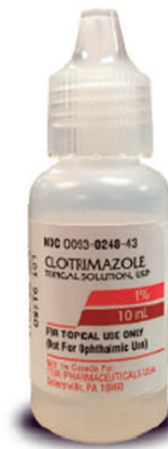
Figure 1. Bottle of clotrimazole 1% topical solution mistaken as an eye drops bottle.

Clotrimazole Topical Solution. We received a report that clotrimazole 1% topical solution was administered into a patient's eye in error.