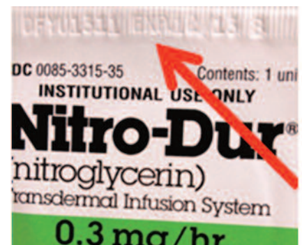
Figure 1. Embossed print is nearly impossible to decipher.

⚡ Yet another expiration date issue. Add yet another problem with the way expiration dates appear on drug products. The NITRO-DUR (nitroglycerin) patch from Key Pharmaceuticals ( Figure 1 ) embosses the lot number and expiration date over a corrugated area that seals the protective paper outerwrap. Unfortunately, this makes the date nearly impossible to read and the numbers 3 and 5 difficult to distinguish. An illegible expiration date on a nitroglycerin patch can result in negative outcomes for residents.